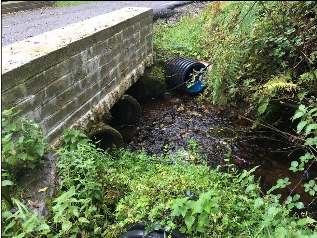
Plate 2-2 Sample Station 2 (grid ref: X 04596 85793) – Q3-4