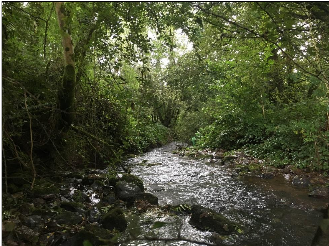
Plate 2-4 Sample Station 4 (grid ref: X 06111 83757) - Q3