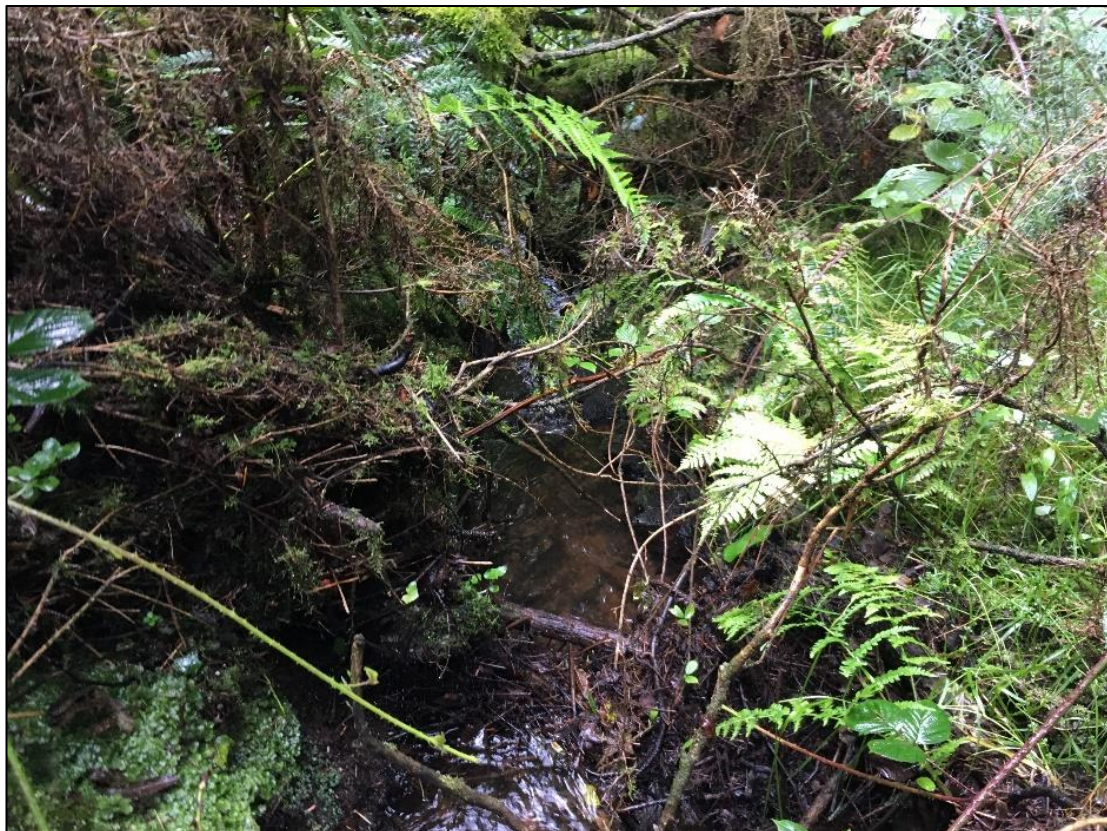
Plate 2-3 Sample Station 3 (grid ref: X 03628 87911) - Q3